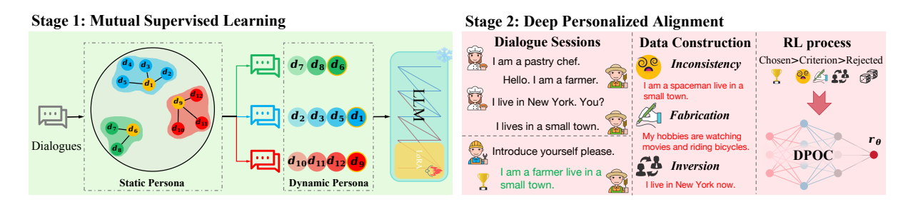
Figure 2: The framework of IDL. Left: the MSL stage that fine-tunes the dialogue model using data organized by static persona and dynamic persona identification. Right : the DPA stage in which we collect three types of criterion examples and conduct DPOC to further optimize the model to align with the target persona in a better way.

Appendix A.2. The persona extractor identifies and extracts persona-intensive utterances from a dialogue by recognizing utterances that contain at least one object in the extracted triples. Formally, the extraction process can be formulated as