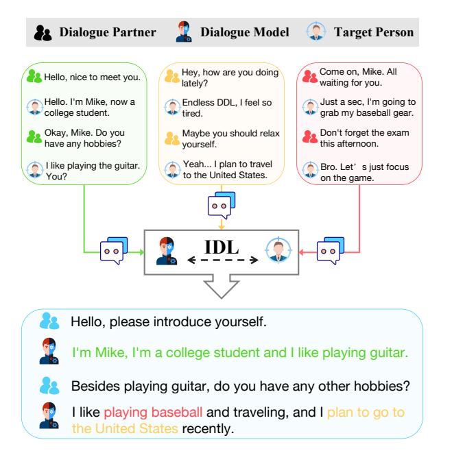
Figure 1: An example of profile-free personalized dialogue generation by In-Dialogue Learning. Persona information in different dialogues is marked with corresponding colors.

A common practice in personalized dialogues is to condition a dialogue model on a pre-defined profile that explicitly depicts the personality traits one aims to portray with a textual description. While there have been extensive studies along this line (Song et al., 2021; Liu et al., 2022; Chen et al., 2023b), we explore the problem from a different angle: instead of using a brief profile to describe a