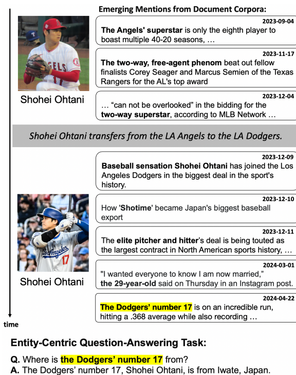
Figure 1: Motivation of our DYNAMICER benchmark. New mentions referring to the same entity are constantly created over time: as Shohei Ohtani transfers from the LA Angels to the LA Dodgers, he is referred to by new mentions such as ‘The Dodgers’ number 17.’ We contribute a dynamic entity resolution dataset, along with two benchmark tests: traditional entity linking and entity-centric question-answering in the RAG context.

In the real world, large amounts of textual information are constantly being generated at an incredible rate. The dynamic nature of human language, characterized by the continuous emergence of new expressions, presents multiple significant challenges (Hirschberg and Manning, 2015). The way we refer to named entities changes over time, influenced by the shifts that include the use of metaphors, adoption of slang, creation of euphemisms, and other linguistic evolutions (Li et al., 2020). For example, consider the named entity “Elon Musk”. Over time, various mentions are used to refer to him, such as “the Tesla CEO”, or “the tech billionaire”. Emerging slang or metaphoric expressions like “real-life