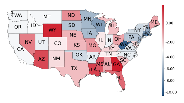
Figure 3: Susceptibility Distribution by U.S. State. We plot the susceptibility score, estimated by our computational modeling (with Bayesian smoothing), for each state in the U.S. The average susceptibility score in the overall U.S. (-2.87) is used as the threshold, with scores above it displayed in red, and those below it in blue. Due to insufficient data points, we are only displaying data for 48 contiguous states within the U.S.

Geographical Community We further investigate the geographical distribution of susceptibility to COVID-19 misinformation, specifically fo-