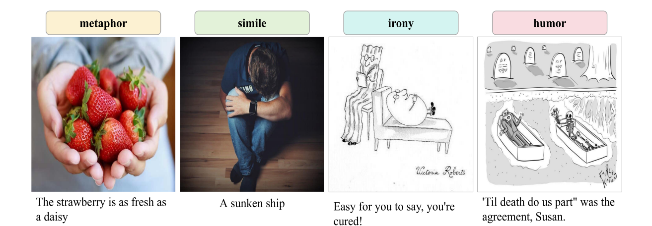
Figure 2: Examples of visual entailment between images and claims.

on recognizing textual entailment (Chakrabarty et al., 2022b), the Multimodal Figurative Language Shared Task introduces an image modality to interpret figurative language. Empirically, images can carry richer contextual information than words. Awareness of abstract implications beyond literal and intuitive meanings is the most significant challenge for this task. Even CLIP (Radford et al., 2021), a state-of-the-art architecture in image-text understanding, achieves only 62% accuracy in multimodal entailment test settings, which is far less than the human accuracy of 94% (Hessel et al., 2023). Moreover, existing vision-language models (Radford et al., 2021; Li et al., 2023, 2022) and generative language models (Raffel et al., 2020; Radford et al.) are utilized separately to predict image-text labels and generate explanations. This results in a decoupling of the task, which is inconsistent with the widely accepted paradigm of endto-end training. Although many large multimodal models (Liu et al., 2024; Jin et al., 2023) perform well on diverse downstream tasks, the availability of large-scale figurative image-text datasets and the requirement for high computational resources are prerequisites for fine-tuning them. Therefore, developing a generic, low-cost, end-to-end multimodal model for multimodal figurative language can potentially further advance the future associated research.