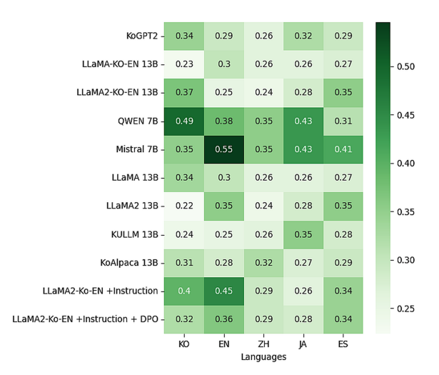
Figure 2: Performance for the understanding of Korean commonsense translated into other languages

29.19%. The performance difference in each type varies significantly across models. Korean-based LLMs tend to perform relatively better in types closely aligned with the linguistic intricacies of Korean, such as grammaticality and plausibility types. QWEN, Mistral, and LLaMA2-ko-en demonstrate robust capabilities in addressing commonsense distortion, memorization, and toxic speech. Models using LLaMA2-ko-en as their backbone demonstrate over 15% superior performance in understanding metaphorical expressions compared to other models. We concentrate on struggles for most models in distortion, toxic speech, and proverb type, where accuracy often falls below 45%. These results show the limitation of relying on mimicking acquired