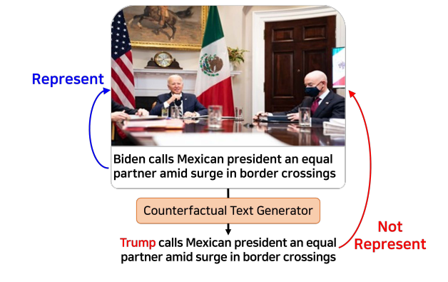
Figure 1: An illustration of the key idea of the proposed method. To assess whether a news thumbnail image represents the body text, the method generates counterfactual text to be used as negative samples for contrastive updates.

This study investigates the representativeness of news thumbnails, which are images displayed as previews of news articles. Visual content often carries a more persuasive impact and leaves a long-lasting impression compared to text (Joffe, 2008; Newman et al., 2012; Seo, 2020). Consequently, the misrepresentation in news thumbnails can cause more critical consequences. Despite its importance, there have been a few studies addressing the representativeness of news images (Hessel et al., 2021; Choi et al., 2022). Achieving the goal requires a model to understand the cross-modal relationship between visual and textual content.