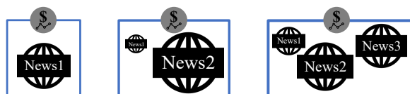
Figure 1: News importance fluctuates when considered in the context of other news. Breaking news (News 2) may diminish the market impact of another news item (News 1). However, if related breaking news (News 3) is considered, the influence of News 1 could resurge.

News1 GPT Store for AI Chatbots Is Coming With Custom ChatGPT. News2 Google Unveils AI Model Called Gemini. News3 GPT-5 Is Now In Training.