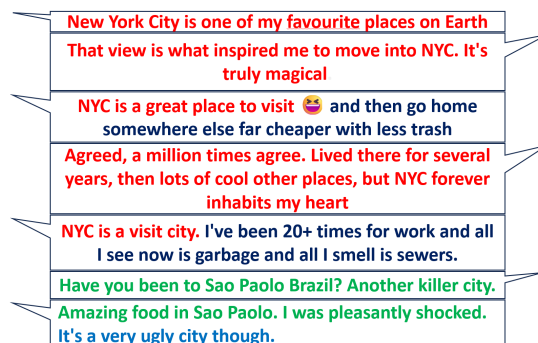
Figure 1: An example from Reddit showcasing a multi-user discussion. Each participant’s input is color-coded to distinguish the varied aspects they discuss, emphasizing the range of perspectives and topics within the conversation. This visual differentiation serves to highlight the diversity inherent in such online discussions.

While QFS and ABS are adept at generating summaries targeted at specific aspects, they typically depend on predefined aspects for querying or model fine-tuning. Dynamic Aspect-Based Summarization (DABS) was introduced to overcome this limitation. DABS identifies aspects dynamically from the content of source articles, transcending the restrictions of fixed aspect definitions.