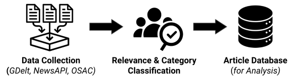
Figure 2: A schematic representation of Insecurity Insight’s data processing system.

Another key challenge is to how to extend the model to new categories, where getting high-quality labeled data for training is expensive or unavailable. Data augmentation is one of the most popular techniques that transforms existing data in a reliable class-preserving manner to create new data (Chen et al., 2023). Self-training (Du et al., 2020; Scudder, 1965) is a promising technique that enables leveraging unlabeled datasets to create pseudo-labels which can be used to further improve the model. Other techniques like multi-task learning and consistency regularization have also been used to tackle this issue. However, more recently, the most popular methods have been to scale up language models and leverage their zero-shot