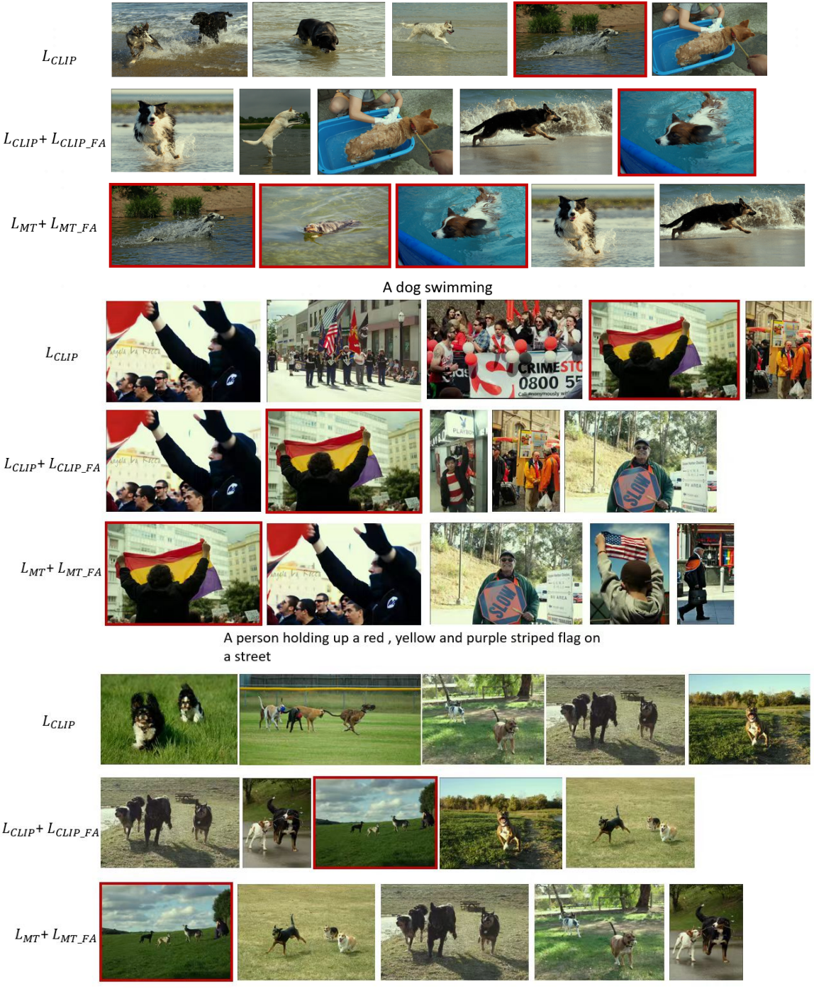
Three dogs are standing in the grass and a person is sitting next to them