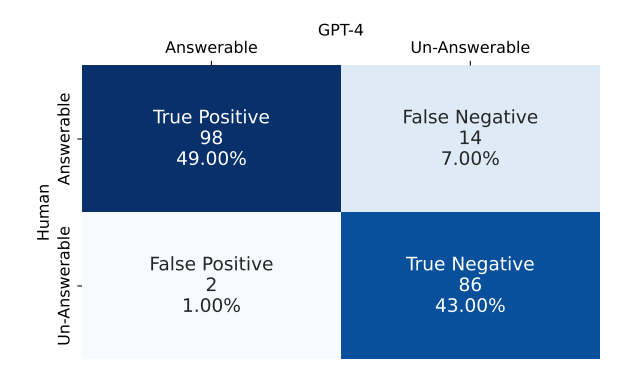
Figure 3: A confusion matrix comparing the decision of human annotators against the quality control step by GPT-4-Turbo .

sufficiently low for reliable evaluation. Additionally, the "true negative" rate of 43% highlights the effectiveness of our pipeline's quality control in mirroring human judgment, ensuring the pipeline's benchmark generation abilities.