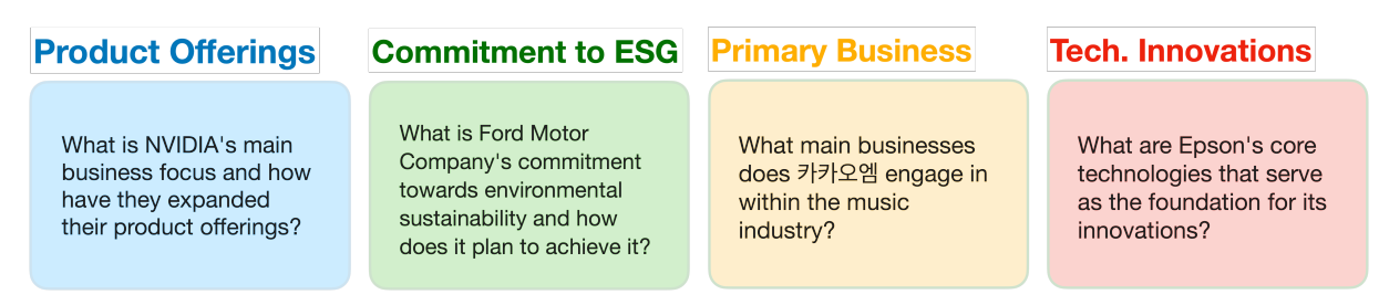
Figure 2: Selected samples of questions included in the KRX-Bench-POC.