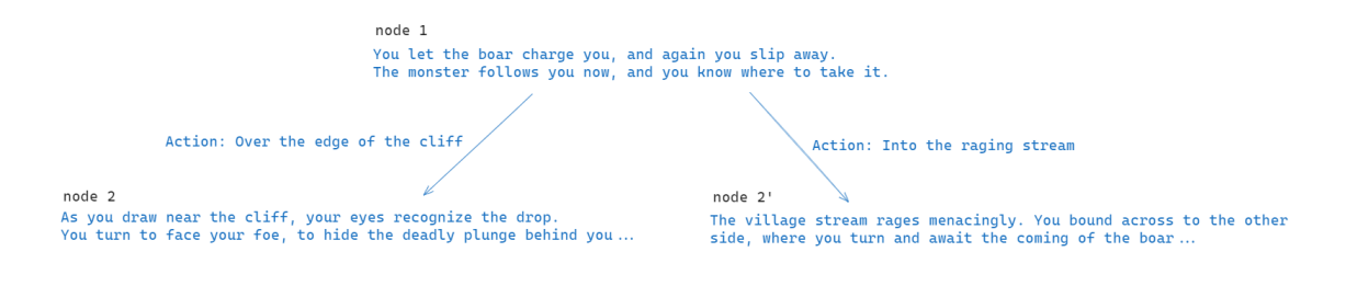
Figure 1: Example of branching in CYOA data, shortened for the simplicity.