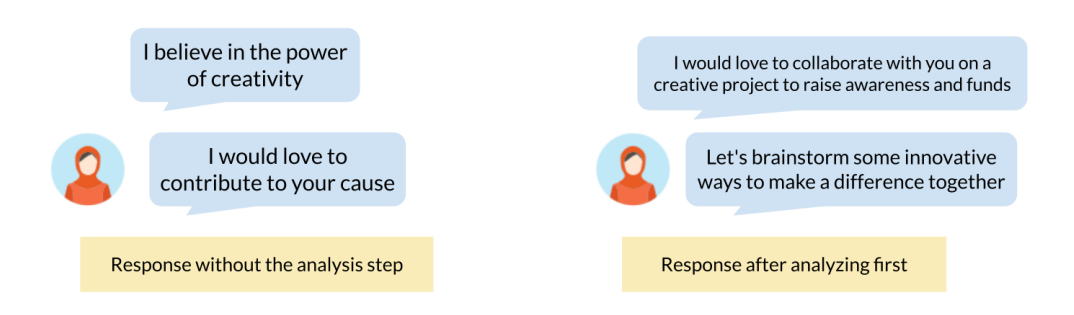
Figure 4: Comparison between the Responses of GPT-3.5 given persona Lily, without (left) and with (right) analysing the input utterance before generating the Response.

Hi, I'm Pat. Please donate to our charity organization. Seeing the community come together in such a wonderful way gives us hope! Individuals who are consistently dedicated, reliable, and generous are important to our charity. Every penny you contribute is meaningful, fueling groundbreaking endeavors for so many children.