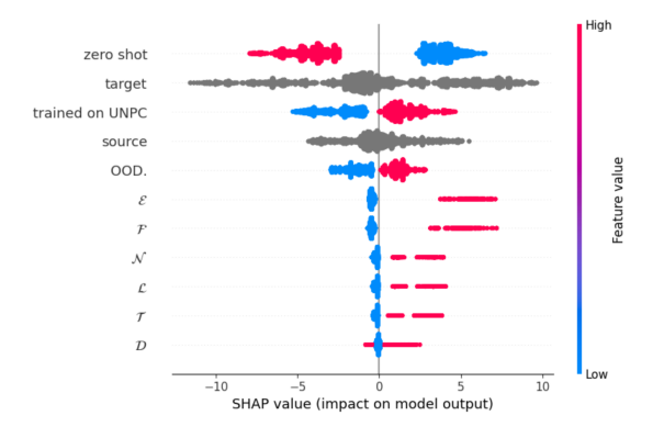
Figure 2: Overview of SHAP values, sorted by mean absolute value. Grey: categorical predictors; red: binary predictors where the value is true; blue, where it is false.

SHAP analysis & predictors importance Are our observations statistically significant? To establish which factors are at play, we rely on SHAP (Lundberg and Lee, 2017), a library and algorithm to derive heuristics for Shapley values (Shapley, 1953). We fit a gradient boosting decision tree