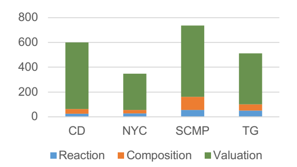
Figure 3: Distribution of subcategories under Appreciation for different newspapers

An additional issue is the disproportionate representation of the Valuation subcategory within Appreciation compared to Reaction and Composition. As illustrated in Figure 3, the instances of Valuation across the four newspapers significantly outnumber those of the other two subcategories within Appreciation. It emerged during the annotation that when segments did not clearly align with Reaction or Composition, there was a tendency to categorize them as Valuation.