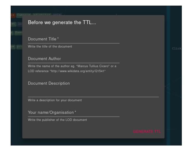
Figure 5: Metadata for the RDF output of the LiLa Text Linker.