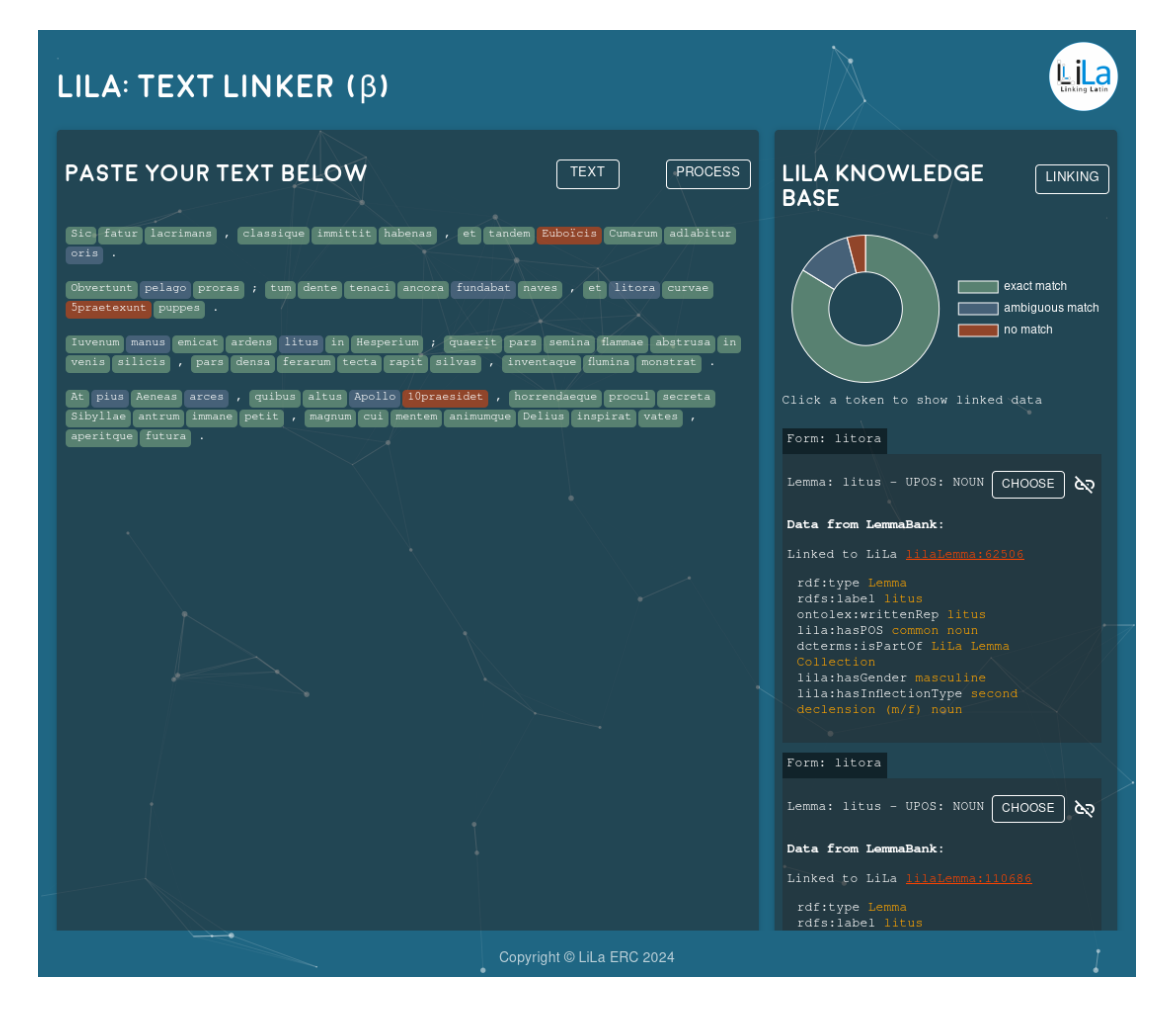
Figure 4: Correcting the lemmatization/linking output with the LiLa Text Linker.