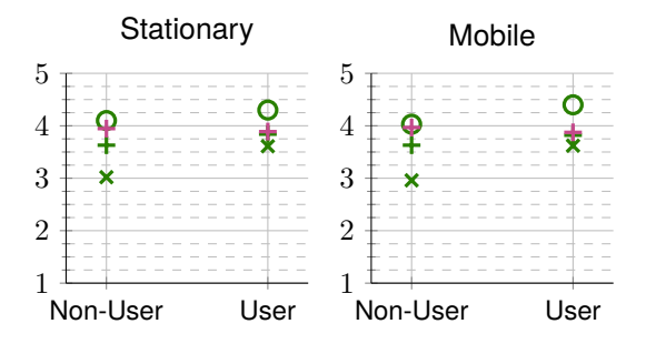
Figure 4: Mean Difference between technology commitment/affinity and usage of stationary and mobile VUIs for German (technology acceptance x, technology competence belief O, and technology control beliefs +) and the technology affinity (+) of the Finnish participants (H7).

to a lesser extent. Significant differences in the German population and the Finish population were observed regarding technology commitment and technology affinity. While a significant correlation was confirmed for the German questionnaire in terms of all three scales and both stationary and mobile usage (technology acceptance: r_{s-stat.}=.278 , r_{s-mob.}=.334 , p<0.001, technology competence belief: r_{s-stat.}=.115 , r_{s-mob.}=.217 , p<0.001, and technology control beliefs: r_{s-stat.}=-.132 , r_{s-mob.}=.129 , p<0.001), for the questionnaire used in the Finnish study regarding technology affinity, no correlation was found, neither for the stationary (r_s=-.036,\ p=0.407) nor for the mobile usage (r_s=-.069,\ p=0.324) .