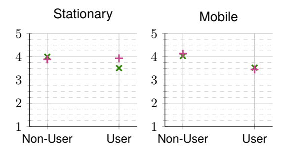
Figure 2: Mean Difference between privacy concerns and usage of stationary and mobile VUIs for German (x) and Finnish (+) participants (H2).

Hypothesis 2 was also confirmed for the German participants, both for stationary ( r_{pb}=-.245 , p<0.001) and mobile ( r_{pb}=-.273 , p<0.001) usage. For the Finnish questionnaire, interesting differences emerge between stationary and mobile usage. While there is no correlation between privacy concerns and the use of VUIs for stationary usage ( r_{pb}=.021 , p=0.444), this is highly pronounced for mobile devices ( r_{pb}=-.374 , p=0.005).