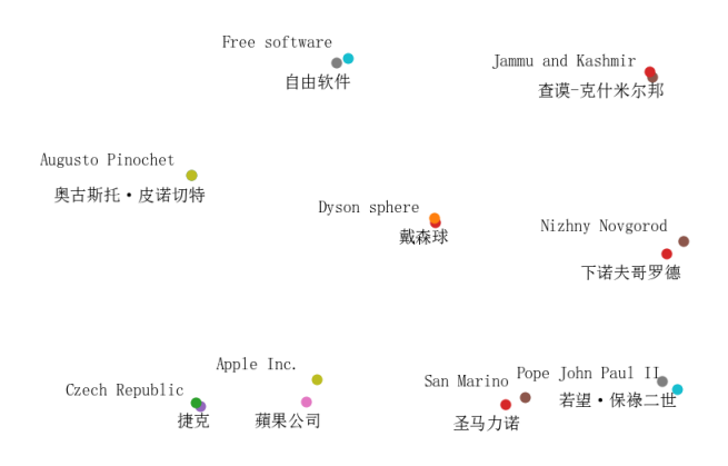
Figure 4: Visualization of the bilingual phrase embeddings trained by MXPR.

We state the difference to our work at last.