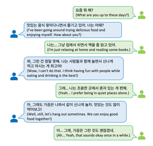
Figure 3: Generated dialog sample

Figure 3 shows a synthetic dialogue generated by our pipeline. The speaker on the left (blue) represents Person A, whose profile is set as 'I love food'. Person A who is characterized as an extrovert. The speaker on the right (green) represents Person B, an introvert.