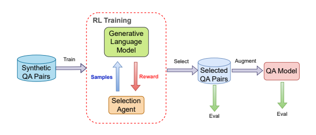
Figure 1: Illustration of our method. A selection agent is trained under reward guidance from LLM based on synthetic QA pairs, and select highquality QA pairs from the same synthetic QA pairs. The selected QA pairs are augmented into the training of QA model.

Previous selection methods can be classified into internal and external approaches. Internal methods utilize the likelihood estimation, known as LM Score, obtained from the QG model for selection (Shakeri et al., 2020). External methods, on the other hand, employ an external model such as a pre-trained QA model (Alberti et al., 2019), a rank classifier (Yao et al., 2022) or a question value estimator (Yue et al., 2022) for selection. While these methods have shown some improvement in downstream QA