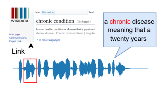
Figure 1: Speech entity linking: recognize mentions from speech and link them to entities in the knowledge base.

On the other hand, as shown in Table 1, despite the recent success in entity linking, the inclusion of audio modality has been completely overlooked. Given the widespread dissemination of short videos worldwide, it is necessary and urgent