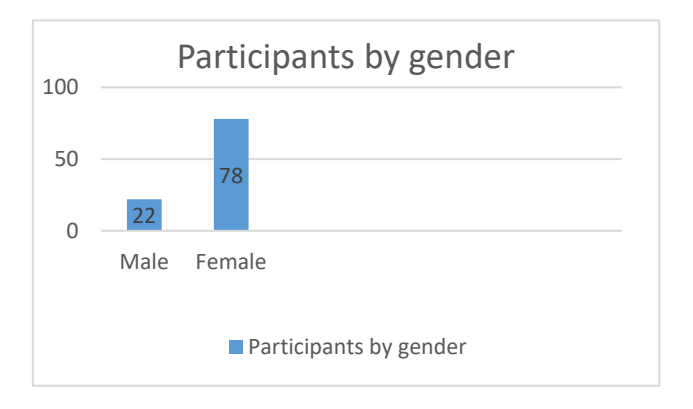
Figure 1: participants' distribution by gender (%)

The 194 participants in the chats are distributed by age group and gender as shown in the following figures (in percentage).