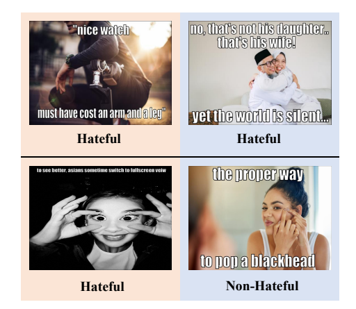
Figure 1: Examples illustrate two challenges encountered by current research works. Left: the misalignment between images and texts. Right: the inherent uncertainty between modalities.

cessively rely on multimodal fusion features, where the inherent uncertainty between modalities has not been explicitly considered, resulting in inferior performance. And the inherent uncertainty is directly reflected in the contribution degree of each modality to hate sentiment.