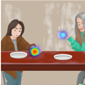
(a) Heatmap produced (b) Heatmap produced when users are asked to when users are asked to select the speaker select the referent