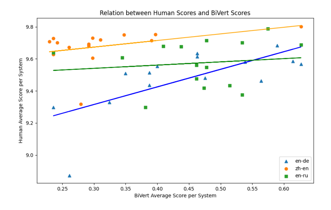
Figure 5: A comparison of average human scores and average BiVert scores for each language pair on all translation systems.

Since the algorithm searches for the minimum total cost we update each value to be similaritu =1-similarity. For each aligned pair, we define the match relation and sum its value according to the category cost definition. Specifically for the Sense relation we apply Lemmatization<sup>1</sup> (currently only in English) prior looking up the words on BabelNet for accurate results. We restricted the sense connection edges to hypernym type only, and limited the graph depth to seven levels. We operate on the most recent version 5.2 of BabelNet as our multilingual encyclopedia resource for extracting words' senses. Finally, we learn the most optimal feature values to aggregate the summed up costs for each relation category, according to the original human reference scores in training data per sentence. We learn the feature values by training a Gradient Boosting Regression model for each language pair. Our training datasets are WMT Metrics Task MQM 2021 datasets in the following language pairs: English \rightarrow German, English \rightarrow Russian, and Chinese \rightarrow English. After fine-tuning our final model, we test our new evaluation method on the WMT Metrics Task MQM 2022 datasets for the same languages. We compare our results to other evaluation techniques by calculating Pearson's correlation coefficient on the averaged human scores and averaged BiVert scores by translation system detailed in Appendix A.