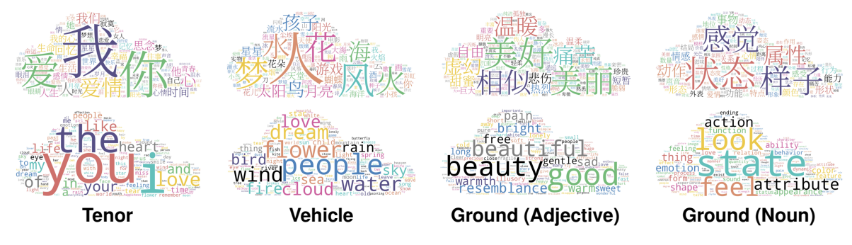
Figure 2: Word Clouds of tenors, vehicles, and adjective and noun components of grounds; the corresponding English word clouds are in the lower row.

ing), utilizing the labels from our annotated dataset. For instance, based off our annotation of the metaphor "他的温柔像海洋" ("his gentleness is like the ocean"), an example prompted for task 1 would be: when constructing a metaphor with "his gentleness" as the tenor and "ocean" as the vehicle, the ground could be "the ability to accommodate" ("包容的能力"); and similarly an example can be prompted for task 2, with inferring the vehicle from the tenor and the ground.