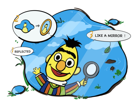
Figure 1: Sketch Map of the Metaphorical Language Writing Process.

Keywords: chinese metaphor corpus, metaphor annotation