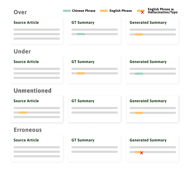
Figure 2: Illustration of Error Types.

other base models. Our results seem to contradict what Ladhak et al. (2020) and Wang et al. (2022) have reported, namely pipeline methods perform better than end-to-end finetuning methods. However, note that their dataset is able to supply gold monolingual article-summary pairs for training the summarizers by exploiting web-mined parallel resources or human translations while ours relies on silver pairs from the Google Translation API. This makes our pipeline methods more prone to error propagation, and therefore may lead to worse performance. This discrepancy in results suggests that end-to-end methods could provide promising results when there are no monolingual resources for training individual submodules.