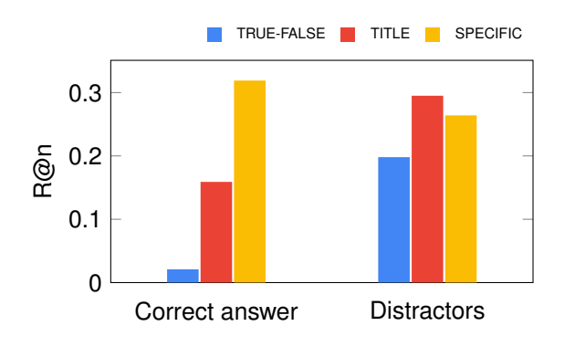
Figure 5: Evaluation of the system performance on different question types; we show Recall@n (R@n) separately for the correct answer and the distractors, as well as for different question types.

[SPECIFIC] questions related to specific information in the passage (e.g., 'what is Jenny doing in the park?').