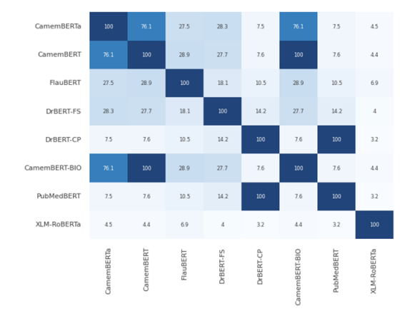
Figure 2: Vocabularies inter-coverage matrix.

So far, there has been a prevailing notion in the community that excessive segmentation of words in tokenization leads to a loss of morphological form and semantic meaning, introducing noise and adversely affecting performance (Church, 2020; Hofmann et al., 2021; Bostrom and Durrett, 2020). However, our experiments, as shown in Table 7, reveal that FlauBERT is the model with the least word segmentation (1.43 in average), while DrBERT-CP tends to have the highest average segmentation (1.90 in average). Surprisingly, when comparing the performance of these two models on the benchmark tasks, we observe that DrBERT-CP outperforms FlauBERT on 16 out of the 20 tasks, thus contradicting previous conclusions drawn by the