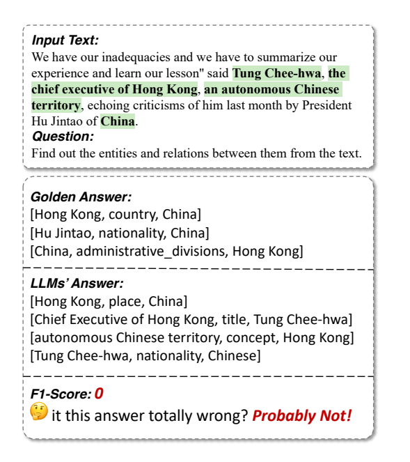
Figure 1: Exemplifying performance discrepancy in relation extraction task. (1) The triple (Hong Kong, Country, China) in golden answer shares the same semantics with the triple (Hong Kong, Place, China) output by LLM, but the conventional metrics would not treat them as the same. (2) The triple (Tung Chee-hwa, nationality, Chinese) in LLMs' output is plausible but not included in the golden label.

correct but missing answers to the golden labels. These two strategies ensure a comprehensive and adaptive evaluation, aligning closely with human judgment.