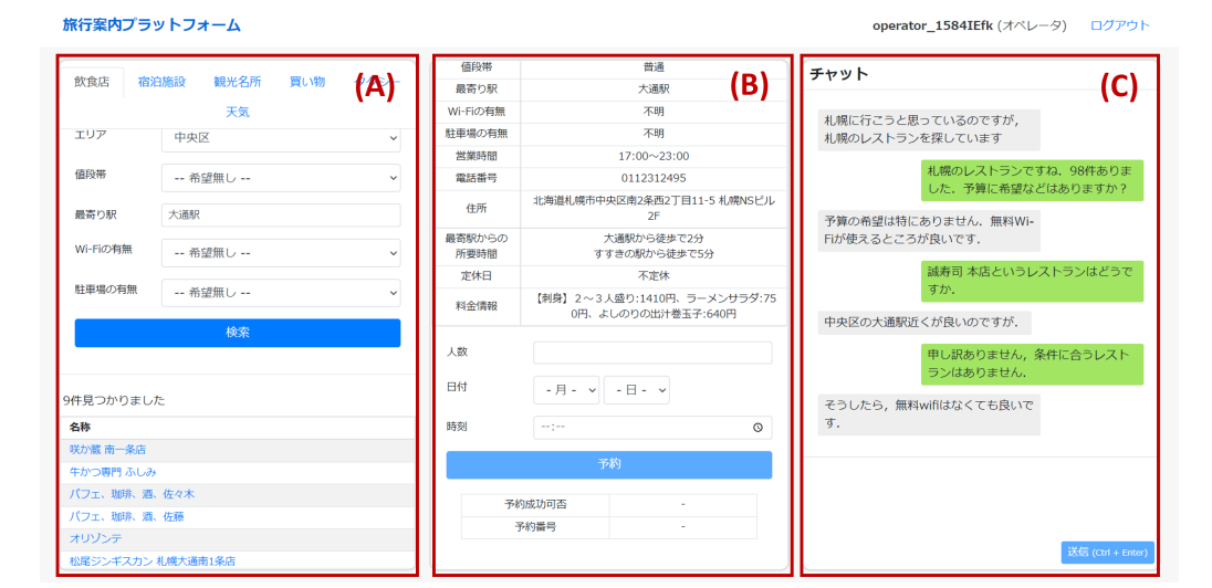
Figure 2: Web UI of wizard for dialogue collection: (A): A search form for an entity from the backend database, (B): An interface displaying detailed information about the selected entity and a reservation form for the entity, (C): An interface for chatting with the user.