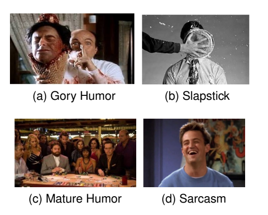
Figure 1: Comic mischief examples in movies

Figure 1 shows sample screenshots of comic mischief categories.