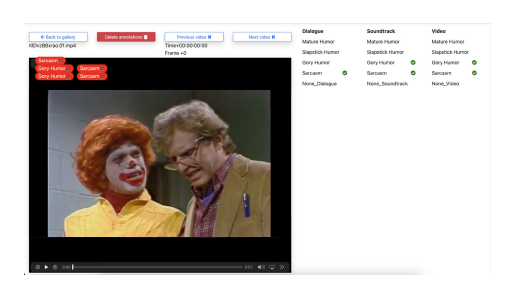
Figure 2: User interface for labeling dataset videos

As a first step, we must enrich the taxonomy of questionable content and establish guidelines for annotators. To create a guideline for annotation, we did the following steps: 1) established criteria for annotation of questionable content and developed annotation guidelines; 2) compiled a list of diverse online videos for use in pilot annotations; 3) to revise the annotation process and components, we conducted several workshops with participants from the fields of psychology, AI ethics, computer vision, and natural language processing; 4) finally, we fine-tuned the guidelines in light of pilot annotation experience and discussion. To ensure the quality of the annotation process, we have implemented a three-way web-based annotation interface displaying each clip with its audio and transcript. This interface facilitates annotations across various comic mischief categories in three modalities, with each clip being evaluated by three annotators. Figure 2 illustrates our web interface. Twelve annotators participated in the task, includ-