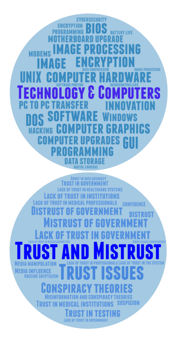
Figure 2: Two examples of final topics summarised by LLMs, namely 'Technology & Computers' (20NG) and 'Trust & Mistrust' (Vaccine dataset).

Topic modelling approaches can control the granularity of topics by setting the specific hyperparameter<sup>7</sup> to fix the number of topics. One can also conduct topic modelling with minimal domain