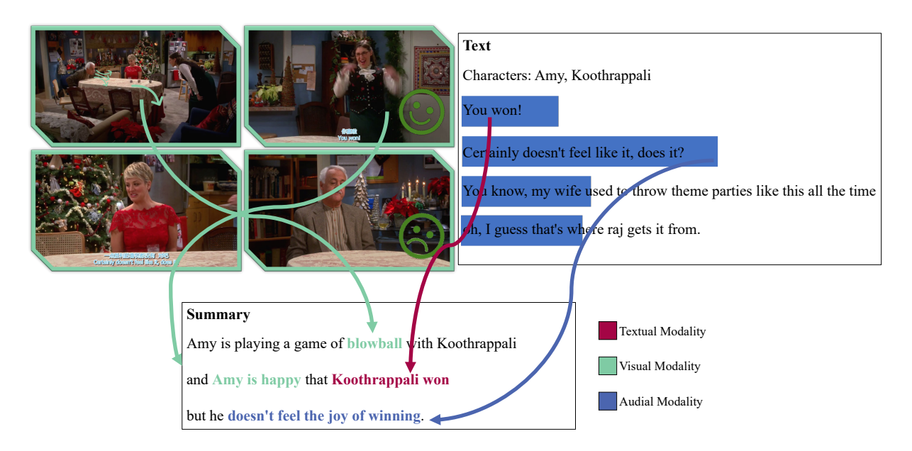
Figure 1: An example from MDS. A case consists of dialogue utterances, a video clip, and a human-written summary.

videos into fine-grained video clips. The annotators are asked to watch the clips and write a target summarization for the multi-modal dialogue. Then, several methods are empirically evaluated on MDS, including the conventional extractive and abstractive summarization models. Analytical experiments show that MDS is a highly abstractive summarization dataset, benefiting from multi-modal information. The poor performance on conventional extractive summarization models indicates that other modal information fuses in MDS. For example, in Figure 1, red is for text modality, blue is for audial modality, and green is for visual modality. In the summary text, the visual modality supplies extra information, "blowball", which cannot be generated from the textual modality. The mood of the characters is also captured by the visual modality, "Amy is happy." The visual modality provides critical facts that do not appear in the textual modality. When