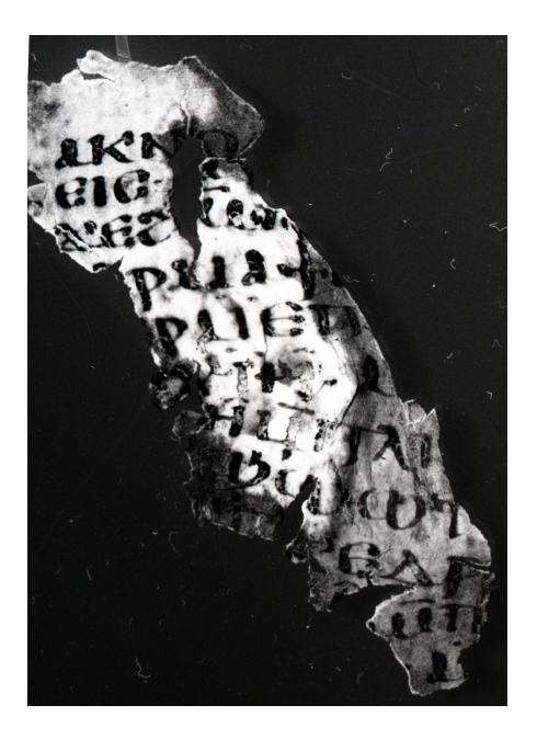
Figure 3: P.Duk. inv. 282 fr. B verso