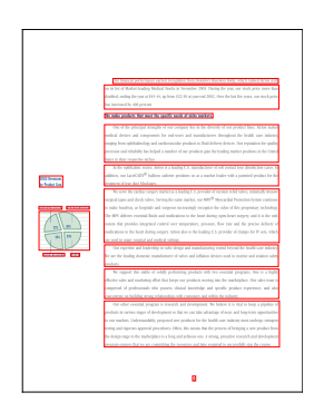
Figure 2: We introduce a benchmark dataset for PDF document translation. Unlike earlier works, our benchmark that focus on sentence-level text or cleanly segmented text, ours tests models on their ability to utilize visual queues for translating text. Above from left to right, are example documents sourced from the RVL-CDIP and DocLaynet datasets demonstrating the complex layout and domains included in the benchmark. Additional examples can be found in the Appendix, Figure ??

contextually related and multi-columnar text is easily understood by human readers. Layout elements can also indicate that certain text should not be translated (e.g. address or name fields) or that tabular data is present. Disregarding layout and visual information can lead to catastrophic translation errors, as demonstrated in Table 1.