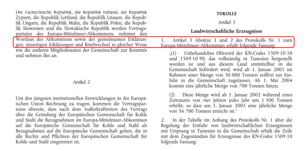
Figure 1: Example OCR errors that occur in layout-agnostic systems. Reading order is lost when extracting text and column breaks are not correctly recognized.

Traditional machine translation (MT) systems primarily focus on textual content at the sentence level, ignoring both global context and visual layout structure of a document. Given that long-range contextual dependencies are crucial for generating high quality translations (Läubli et al., 2018; Toral et al., 2018; Hassan et al., 2018), these systems fail short of achieving human translation quality when considering entire documents (Junczys-Dowmunt, 2019). Several auhors have sought to address these gaps by including additional context, but these focused solely on text content (i.e. preceeding sentences) (Fernandes et al., 2021; Lopes et al., 2020;