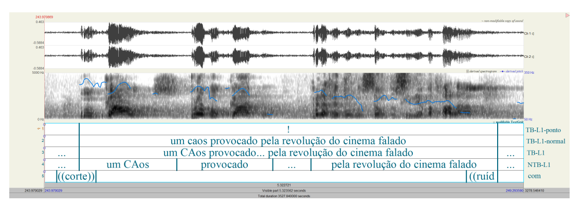
Figure 1: Excerpt from SP_EF_153 with five layers annotated in Praat.

based platform for transcription revision. The revision of automated transcriptions were performed from June 2023 to December 2023. In total, 14 annotators have worked in AC. The revision process was based on an annotation guideline designed to help making the revision uniform and contains 11 rules: