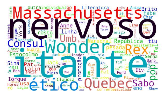
Figure 2: Word cloud with 150 most important tokens for classification

From these results, we observed that there are no tokens that concentrate much importance (high absolute value) as in the previous corpus, in which punctuation and question words were clearly more important. In Figure 2, we present the 150 most important tokens (or subtokens, as they are given by BERTimbau's tokenizer) as a word cloud; the more important a token, the larger the word<sup>5</sup>. We note that the importance of a specific token is given by the average absolute Shapley value across every instance in which it occurs.