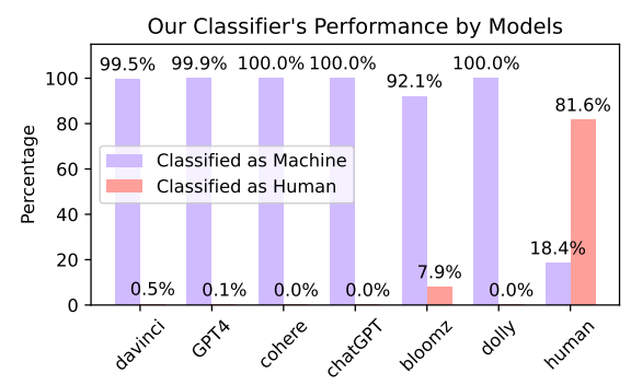
Figure 2: Performance of our classifier across models.

We further analyze the performance of our best model across different LLMs on the test set, as illustrated in Figure 2. The results show that our model accurately identifies texts from Dolly-v2, Cohere, and ChatGPT as machine-generated, and achieves near-perfect classification precision on texts from GPT-4 and Davinci003. BLOOMZ is the only model that presents a problem for our classifier, with an 8% misclassification rate. Additionally, we observe that 18% of HWTs are incorrectly classified as being generated by machines. This shows the remarkable generalizability of our approach compared to Wang et al. (2023), who reported that "it is