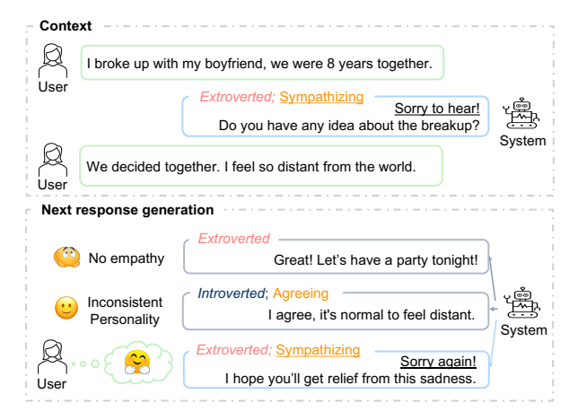
Figure 1: Different personalities exhibit distinct preferences for empathetic intents<sup>1</sup> in responses (Richendoller and Weaver III, 1994; Mairesse and Walker, 2010). In a given context, the user shows varying feelings to the system's responses, where the system encompasses empathetic expression and consistent personality traits, resulting in a more human-like interaction.

Empathy integrates cognition and emotion, involving understanding and responding emotionally to others' situations (Davis, 1983). Consequently, prior research has focused on methods to generate empathetic responses by improving affective expression (Lin et al., 2019; Majumder et al., 2020;