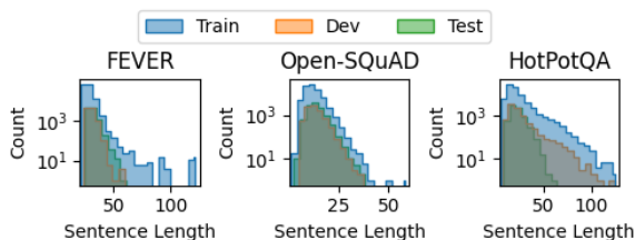
Figure 2: The sentence length, measured by the number of tokens in a question, from the FEVER, Open-SQuAD, and HotPotQA datasets

et al., 2016; Karpukhin et al., 2020), and HotPotQA (Yang et al., 2018). Considering the use of sentence length as a parameter for estimating complexity has been implemented in various NLP tasks (Platanios et al., 2019; Spitkovsky et al., 2010), to assess HGOT across different complexity levels, we stratify the three datasets based on sentence length, categorizing them into long, medium, and short.