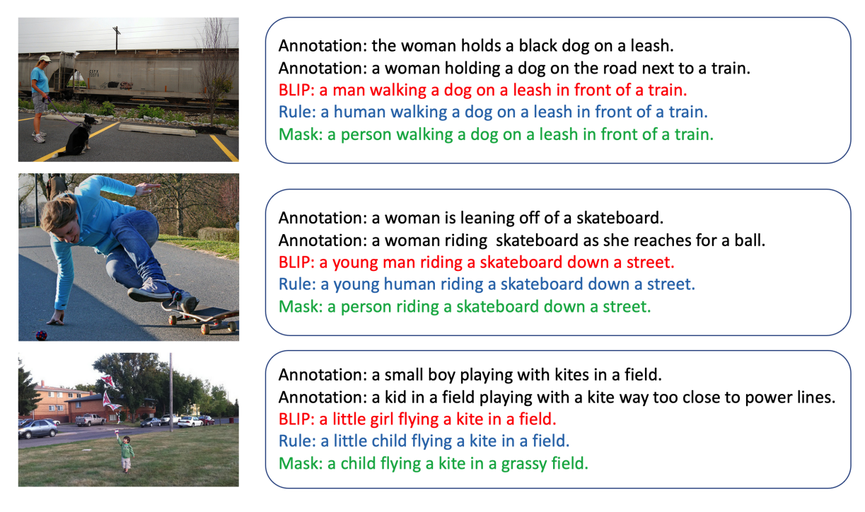
Figure 3: Qualitative examples showing annotated and generated captions. We present three images for which BLIP has predicted the wrong gender class.

dant "little" but also adds an extra description for field. This shows potential benefit of Mask: when the caption generator is masked and does not focus on the gender terms, it focuses on other salient parts of the image and describes that in more detail.