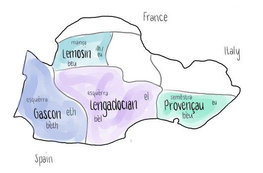
Figure 1: Dialect map of Occitan. The four dialects included in this study are highlighted, along with examples of lexical (i.e., "mança" and "senèstra") and spelling (i.e., "bèu" and "beu") variation between the dialects.

However, with many of the recent successes in text normalization coming from neural networks, such as sequence-to-sequence (seq2seq) models that map orthographic variants to canonical forms, normalization can become computationally costly (Lusetti et al., 2018). Furthermore, such supervised methods are generally impractical for low-resource languages, as these languages often lack labeled datasets with standardized word forms. In the case