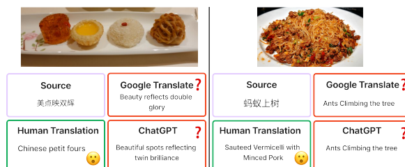
Figure 1: CSI translation errors by Google Translate and ChatGPT 3.5 in translating Chinese culinary terms.

A key challenge in menu translation lies in the handling of Culture-Specific Items (CSIs), defined