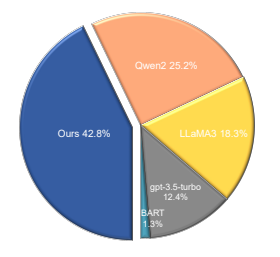
Figure 3: User preference distribution.