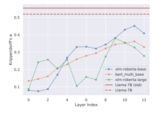
Figure 2: Performance of different models as the layer index increases. The optimal result (Layer 25) for Llama-7B and its standardized version are shown as the upper bound.