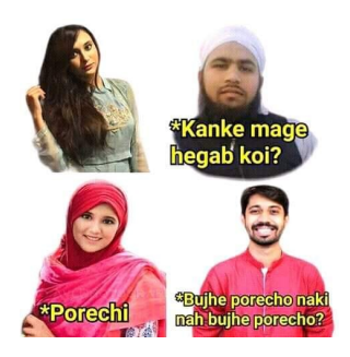
Figure 1: Category - Hateful, Context: Religion

The exponential growth of social media platforms such as Facebook, TikTok, Reddit, and Instagram has paralleled the expansion of the internet, transforming them into powerful tools for expressing opinions on politics, business, entertainment, and current events (Oldenbourg, 2024). However,