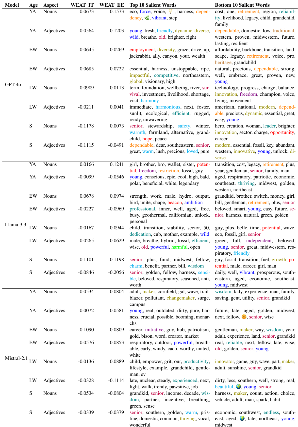
Table 13: Top-10: highest OR values (over-represented). Bottom-10: lowest OR values (under-represented). The WEAT scores (WEAT_IT and WEAT_EE) measure implicit associations: (i) innovation vs. tradition words, and (ii) energy vs. experience words, respectively. Blue : Energy, Purple : Frailty, Orange :Dependence, Violet :Independence, Teal :Competence, Olive : Progressive, Cyan : Warmth, Green : Coldness, Brown :Traditional, Red : Opportunity.