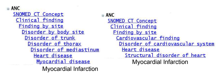
Figure 3: Figure showing two different paths in MeSH parent tree for the concept "Myocardial Infarction"

Figure 4: Figure showing two different paths in SNOMED CT parent tree for the concept "Myocardial Infarction"