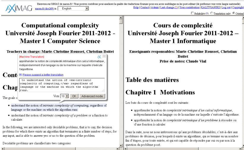
Figure 4: a bilingual view of the document being translated.

The documents are then placed in a repository accessible to iMAG-MACAU that can be visited at http://service.aximag.fr/xwiki/bin/view/imag/macau-fr . Users can now navigate and post-edit the documents in different languages. Since iMAGs preserve the underlying html code of a page, the annotations are never lost and whatever content generated from these files using the semantic annotations, has its segments translated. We are currently developing tools that would allow reversible conversion in order to generate translations of documents in their initial formats.