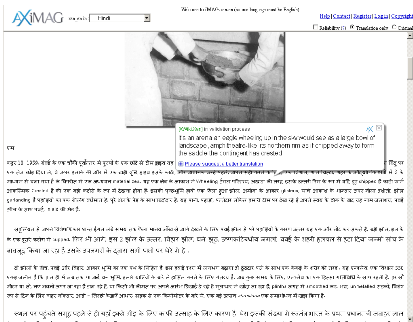
Figure 5: translation of Rohit Manchanda's "Monastery, Sanctuary, Laboratory: 50 years of IIT-Bombay"

The use of volunteer workforce for the translation of literary works is a novel approach. Fig. 5 demonstrates a chapter of Rohit Manchanda's “Monastery, Sanctuary, Laboratory” being translated from English to Hindi.