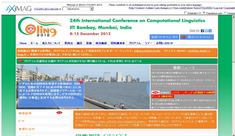
Figure 1: COLING 2012 website accessed in Japanese through iMAG-COLING

When the user chooses to display the page in a new language, the textual segments of the page are substituted either by a new translation or, if the page has been translated before, by their best translation retrieved from the translation memory. The translation of a segment can be edited by hovering the cursor above the segment. This brings up a bubble containing the segment in the source language, an editing zone and a choice of a score to be assigned to the post-edited translation. Figures 1 and 2 show the interface of iMAG-COLING.